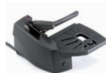
Hook Switch GN1000 RHL

9950113 Issue 2, 2010-01 We reserve the right to make changes in performance and specification without prior notice.