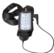
Bluetooth Solution Kit